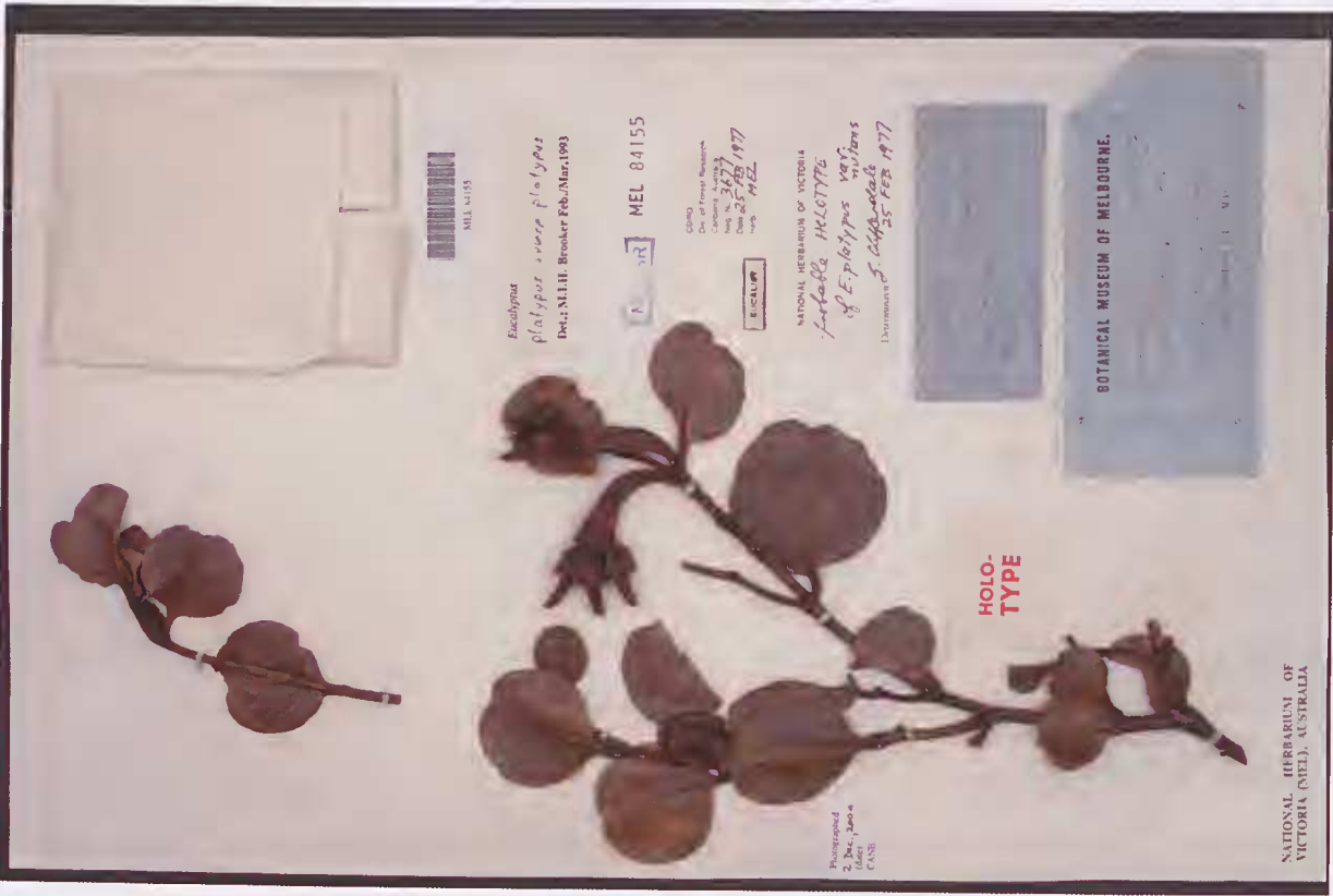
Figure 1. Holotype of E. nutans.